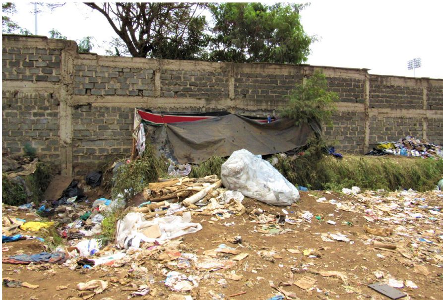
Fig. 4. Extremely precarious shelter where waste pickers were living, inside the dumpsite.

We condemn the living conditions under which these people were living, but we do not blame them for being found in this situation; instead, we strongly encourage the local government to implement social programs that would generate income and employment for them. Our visit to Kachok confirmed the precarious sanitary conditions and environmental impacts that the dumpsite poses to Kisumu's population and biota, but it also unveiled social inequalities related to waste management that were not previously disclosed to us in our consultations.