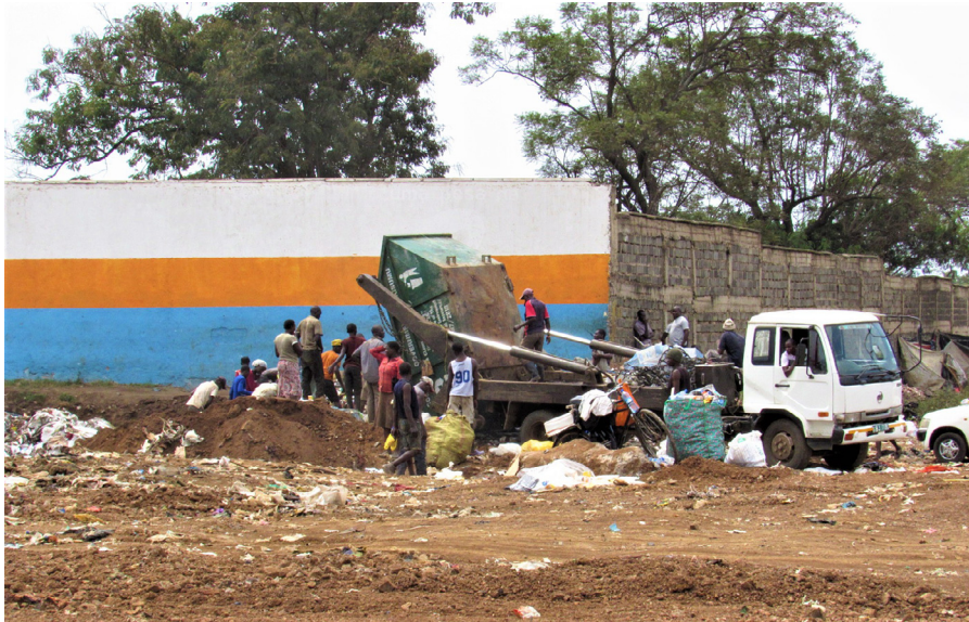
Fig. 3. Waste being disposed in Kachok by a collection vehicle, and waste pickers awaiting to sort out recyclables and other valuable materials.