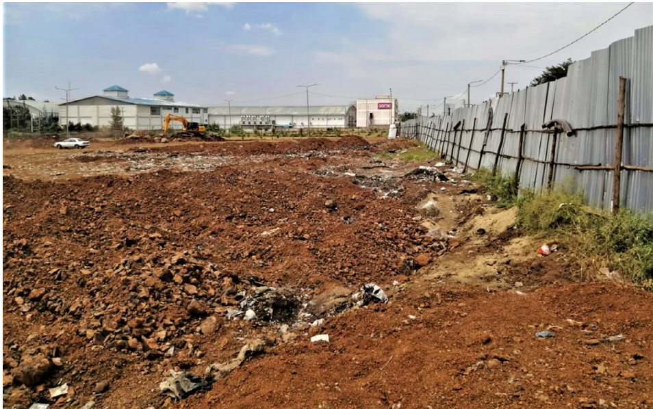
Fig. 1. Kachok dumpsite under rehabilitation: fence to the right, waste removal and soil movement activities, and planting of trees in the distance.