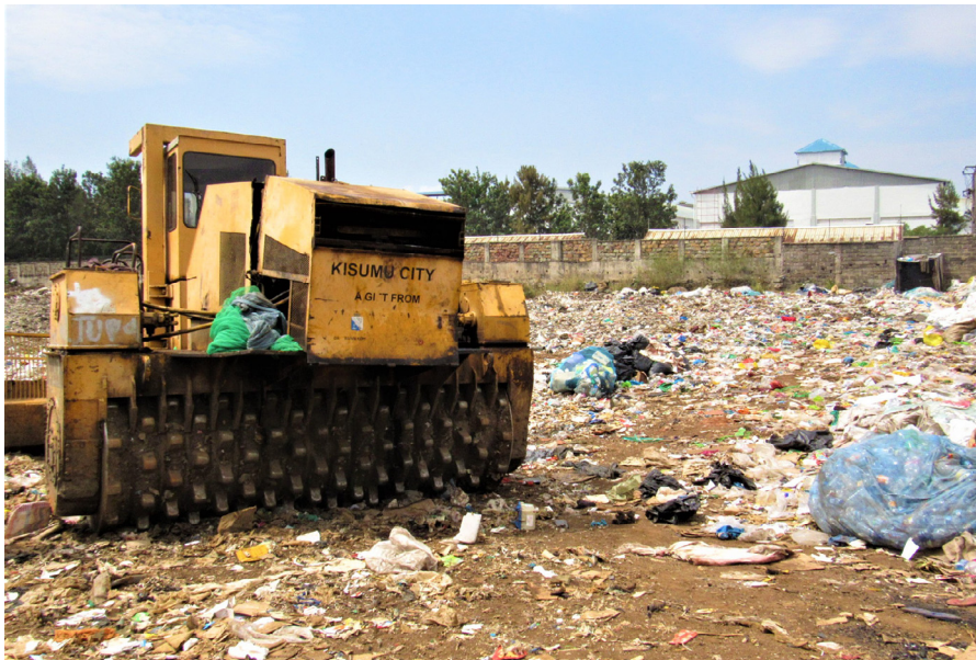
Fig. 2. Back portion of Kachok still housing fresh waste, and a compactor machine.