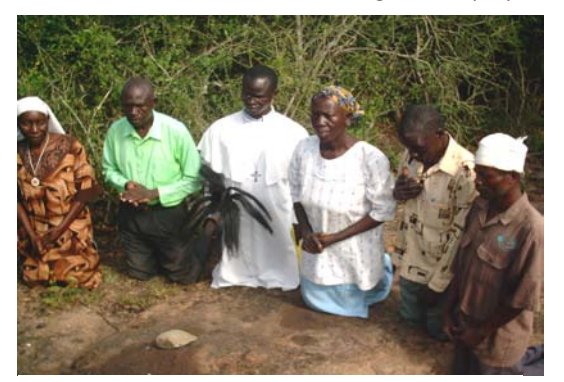
Figure 2a: A prayer session at Asumbi Rock. "A rain making site which has turned to be an alter for prayers"

Some African independent churches such as Legio Maria believe that particular sites within the Forest have supernatural powers that help in the intervention of human problems. Followers from various parts of Kenya and other African countries (for example Tanzania, Uganda, Nigeria) make religious pilgrimages to pray and experience the powers (Figures 2a and 2b). Religious individuals from other Christian faiths also find the serene and solitude nature of the Forest congenial for prayer and fast.