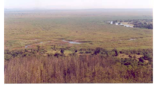
Figure 4c: Reeds in the Yala swamp - provide a habitat for rare fish