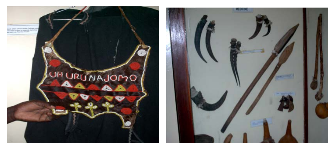
Figure 5a: Part of Jaramogi's regalia