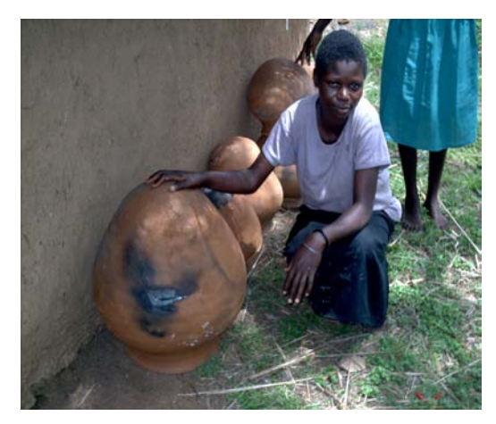
Figure 3e: Pot clay mine