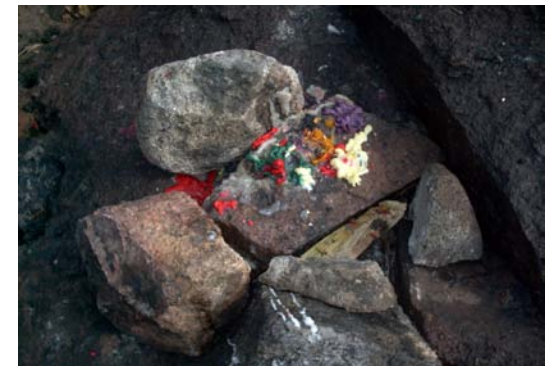
Figure 2b: A prayer alter at Asumbi Rock