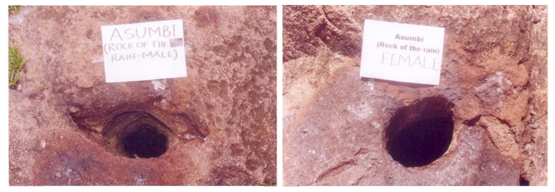
Figure 3c: Asumbi Rock, Male

Independent Church faithful. In order to bring rain, sacrifices in form of goats (a white he-goat) and a brown cockerel would be slaughtered, roasted and eaten at the site. As this was done, blood from the animals and a local alcoholic brew were poured onto the male and the female holes which are part of the rock. During the sacrificial process, song and dance would be made in praise of the two stone lids that covered the male and female holes. After the ceremony, people left for their homes but while still on their way, the rains would start falling on the land. The lids to the two holes were believed to have powers and this was shown in 1966 when a primary teacher by the name of Okech Adams from Alego in that since the 'spirits' were not happy to be moved away from Lwanda Asumbi, Siaya District took one of the stone lids to his custody. It is believed, they turned on the teacher and he became mad. The teacher brought back the lid and a He-Goat to the rock even though he is still mad to date.