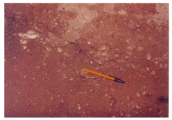
Figure 4a: An archaeological site in Ulowa

The region surrounding Got Ramogi and beyond is a melting pot of rich and varied archeological site depicting the lives and migration patterns of the Nilotes, dating to thousands of years back (Odede, 2000; Ochieng', 1985; Ogot, 1967). One such site is exemplified in the area of Ulowa, at the foot of Got Ramogi. In addition to Ulowa, there are several naturally sheltered settlements having shrines in the region of Got Ramogi and beyond, for example, Gunda Pudha (Figures 4a-4b) and Bur Gangu which is famous for iron artefacts. These sites provide excellent opportunities for archeological tourism.