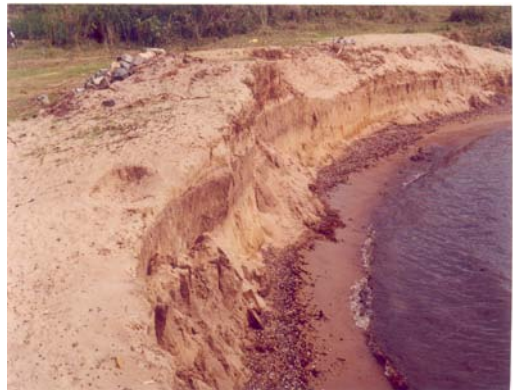
Figure 4b: Goye Beach - Potential for sun and sand bathing as well as tourist hotels