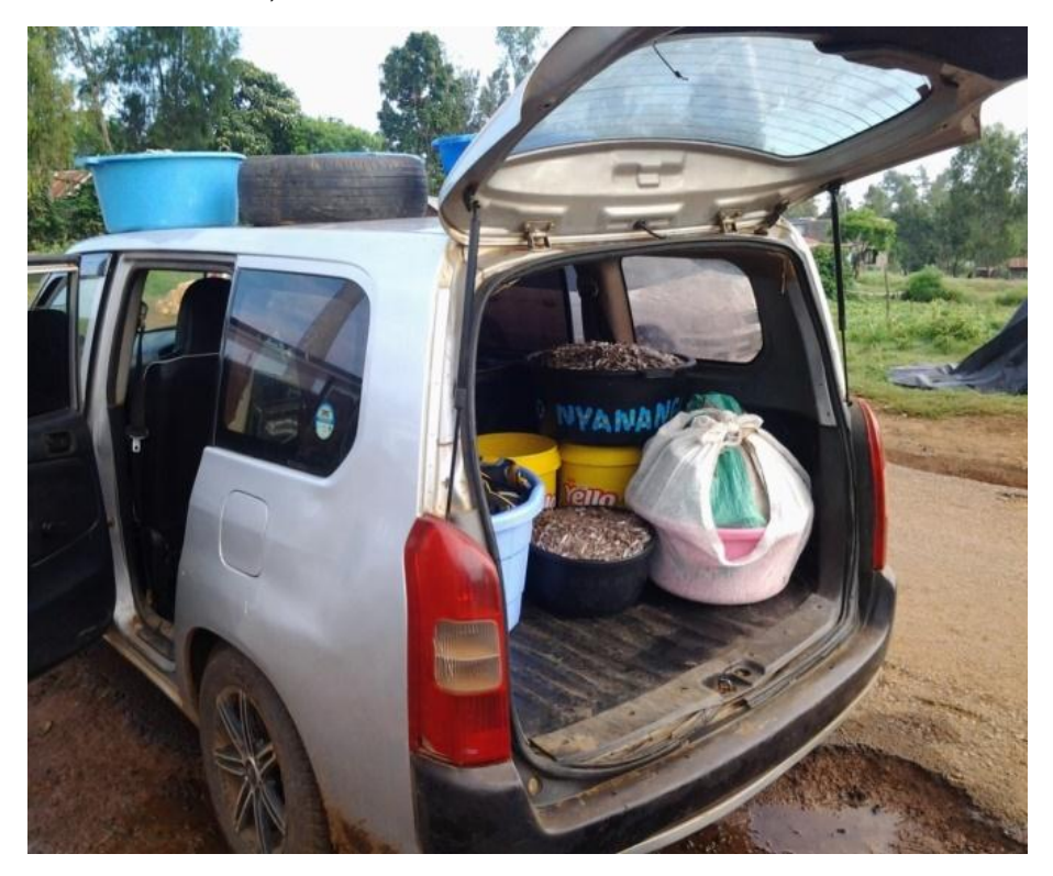
Figure 3: Transportation by probox van