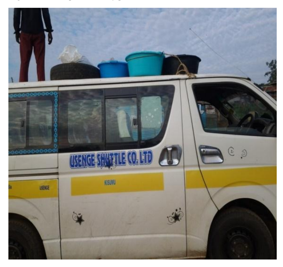
Figure 4: Transportation by 14-seater van (matatu)