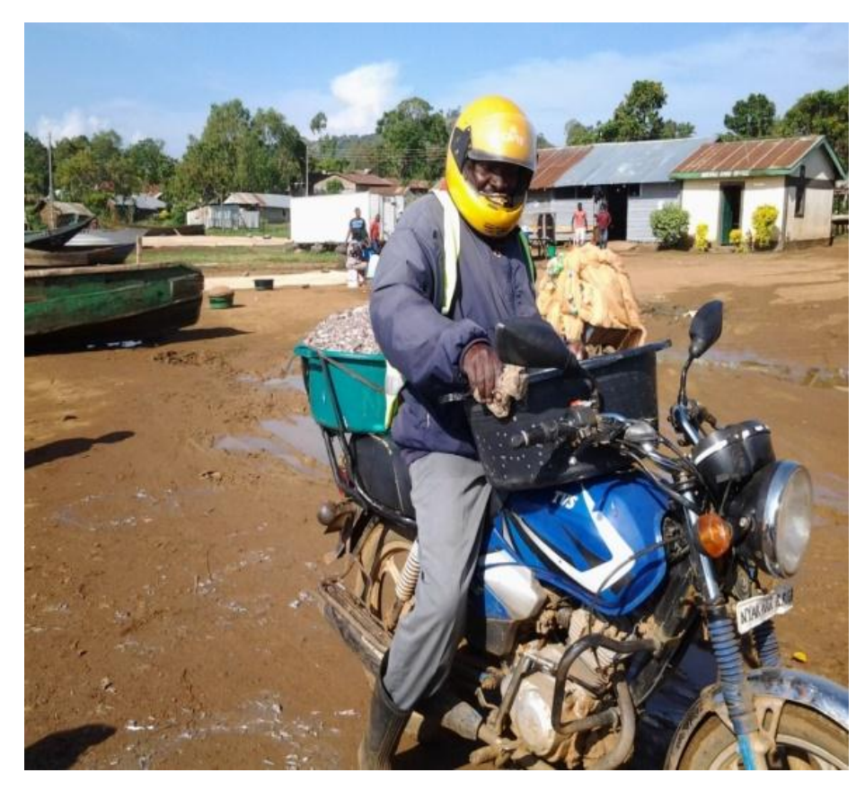
Figure 2: Transportation by motorcycle

There was, however, a positive relationship between amount of fuel and CO_2 liberated at 0.108. This indicates that matatu which consumes more fuel than probox van, and probox van more than motorcycle; emit higher volumes of CO_2 L per kg<sup>-1</sup>km<sup>-1</sup>. This is because larger engines have many larger compression cylinders translating into higher fuel consumption while smaller engines have few smaller cylinders which translate to less fuel consumption. Nevertheless, the significance of the relationship between distance travelled and weight to carbon emitted overrides that of amount of fuel used. Figure 2, 3 and 4 are the modes of transport used in the study.