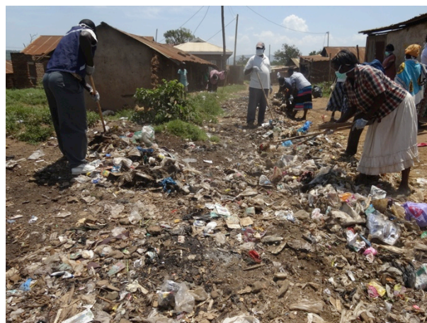
Cleanup exercise in Obunga.

Three clean-up exercises were organized by the research team in Obunga area, where open and indiscriminate dumping and burning is mainly practiced. There is no organized waste collection by waste pickers or even the City. The aims with the clean-ups were to sensitize the residents on better waste management practices, to bring the City on board to collect and transport waste from temporary transfer points to the dumpsite and to create an opportunity for a private waste picker group to evolve and continue with waste management activities within the area.