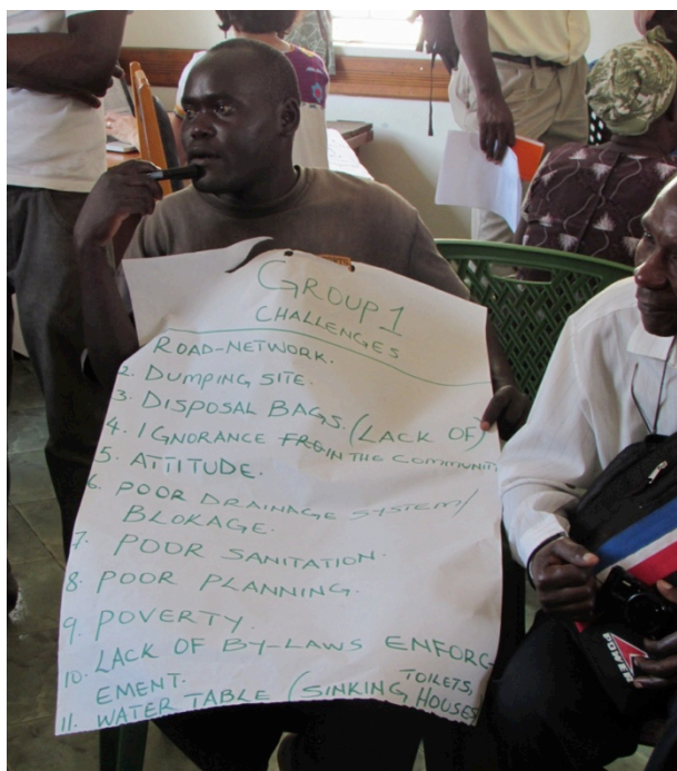
Focus group with residents in Obunga.

From the focus group discussions with the residents it is clear that much needs to be done. In Nyalenda, clean-up activities, organized by the area Ward office, are carried out with some frequency, and in Obunga with less regularity. Many residents also appreciate that waste-pickers collect some of the waste. They are also open to private waste collectors, or that they coordinate the waste collection themselves. Moreover, the residents themselves need to stop throwing waste anywhere. However, a major problem remains how to evacuate the waste out of the settlement area once it is collected. To make progress, everyone involved need to feel confident that the City will collect waste regularly at designated collection points.