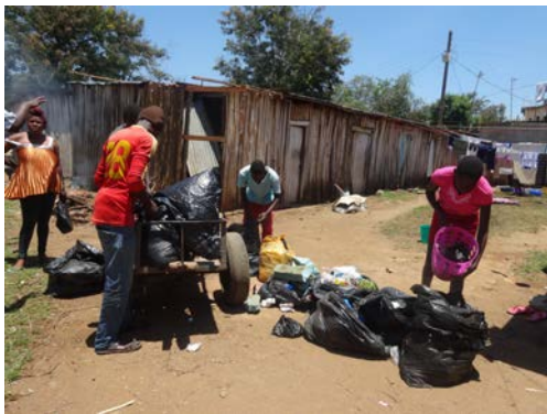
Left: New Waste picker's group in Obunga at work. Right: Temporary transfer point in Obunga used by the new waste pickers' groups