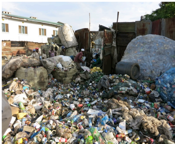
Purchaser of recyclables.

Waste "scavengers" and waste pickers are exposed to fluctuating prices and dishonesty when selling collected recyclables. Existing informal networks between waste pickers should be turned into associations or cooperatives to secure their collective interests. This could be linked to new recycling centers in informal settlements.