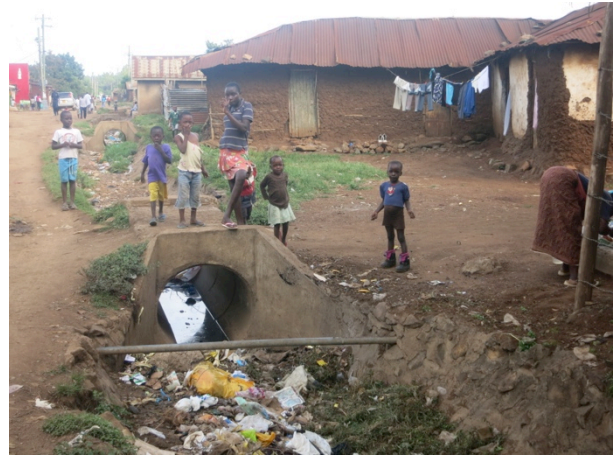
Nyalenda, one of Kisumu's informal settlements.

service delivery; strengthening micro-enterprises and community-based groups to provide waste management services; building the capacity of the municipal council to effectively implement the strategy as well as some start-up machinery. Today, waste collection efficiency is still at 20% in Kisumu and informal settlements are largely neglected 9 .