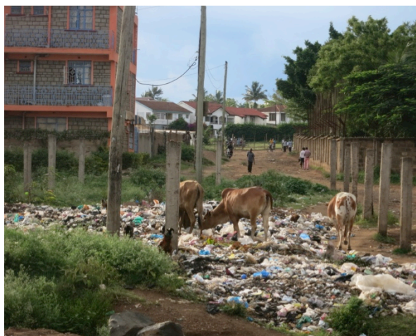
Uncollected waste along main road in Kisumu. Animals seraching for organic waste amid faeces and toxics.

50% of Kisumu City's population is poor with difficulties to take full responsibility for their waste. Most of them do not understand why their waste is not collected by the City. The authorities need to reconsider how waste management is communicated, financed and carried out. Well-defined collection points at ward and neighbourhood levels have to be established where the City/County takes on responsibility for managing household waste.