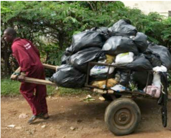
Waste picker in Migosi area.

Environmental entrepreneurs play important roles for providing waste collection services in informal settlements. The article examines the process by which such entrepreneurs evolve and succeed to consolidate their operations through the institutionalization of a co-production of critical services. The entrepreneurs are part of emerging experiences in the waste management sector that benefit from being studied as social and solidarity economy 1516 as well as through the evolving field of social and environmental entrepreneurship theories 17 .