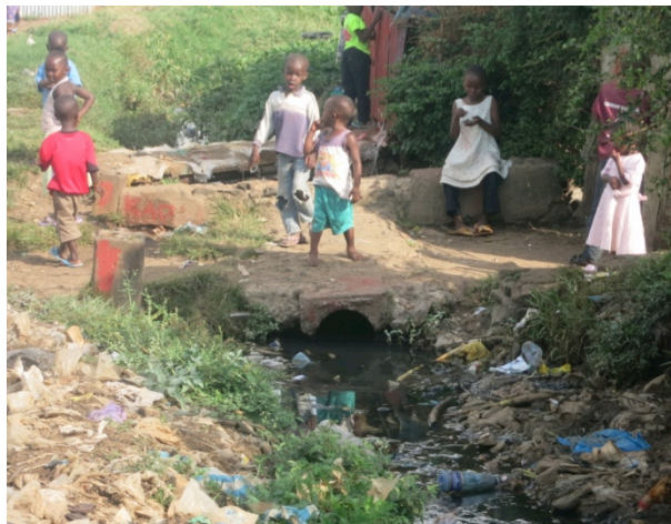
Waste blocking drainage.

Today, most of the waste is left along roads, passageways and empty lots, leaving the daily life of Obunga infested with all sorts of waste. Clean up activities have been used to improve the situation but the effects are meager. Clean ups are still appreciated and can be used to change people's attitudes and actions linked to waste but the ultimate goal should be to make clean ups redundant.