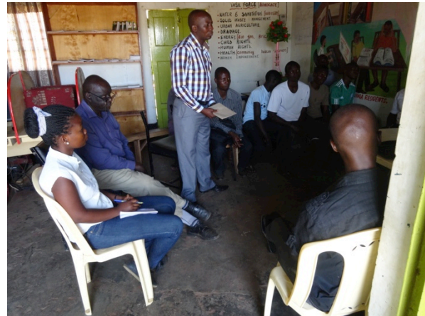
Meetings with the new Obunga Waste Pickers group and Successful Waste Pickers group.

By providing waste management services in informal settlements in Kisumu where the City is practically absent, this new hybrid and decentralized waste collection model has turned into being the "norm". It is now referred to in policy documents and by policy actors as a "best practice" in the region.