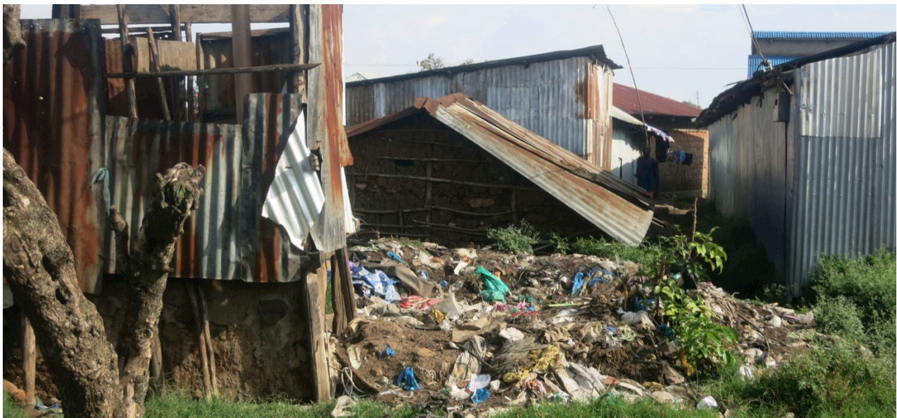
Waste overflowing Obunga.