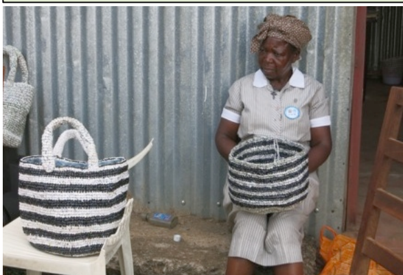
Plastic waste turned into handbags, TemaTema, Bamato CBO.

Associated Grinders Bamato Clean Kisumu General Investment GasiaPoa Kachok Dumpsite Kibuye waste recyclers Migosi TemaTema Women Group TichK'Ouma Urbane Solutions