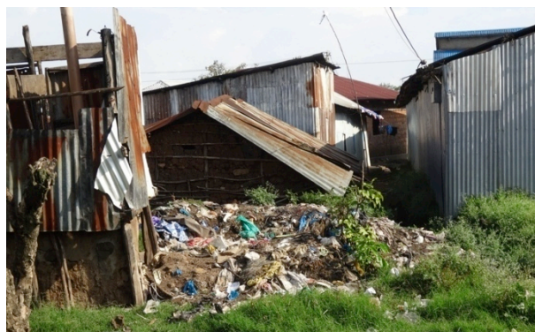
Solid waste rising above normal ground level.

Obunga and Nyalenda are somewhat different neighbourhoods. Nyalenda is more centrally located, while Obunga is more rural and has more flux of habitants with landlords living elsewhere. Still, the major problem for both places is a lack of sites where waste can be collected for transport to the dumpsite. There used to be skips (containers) especially in Nyalenda, that the city emptied, but that does not work anymore. Many still throw their waste where the skips used to be, which creates illegal dumpsites in the residential area. In Obunga, lack of toilets and sewers, coupled with poor drainage, turn the ditches into hazardous sources of disease and stench. Solid waste often blocks the flow, which creates even more problems. Waste lying around, or flying around on windy days, is a constant annoyance.