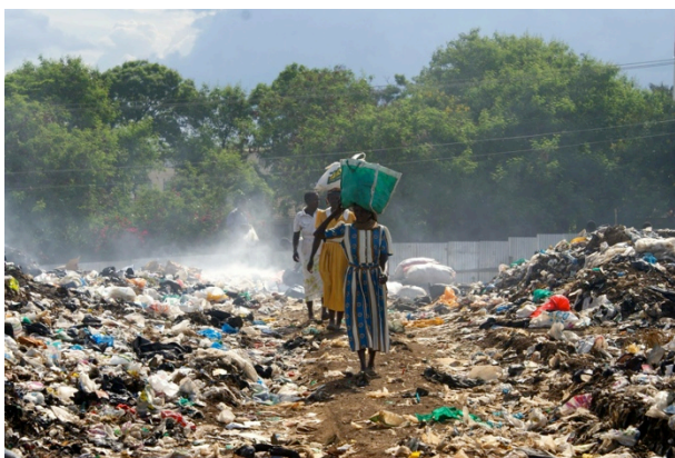
Waste pickers at dump site carrying their recyclables.

Individual waste pickers were approached through two focus group discussions. It became clear that waste picking often is the only possible livelihood for those who have lost their jobs, had an accident, lost parents, or come from non-functional families. Most of them are introduced to waste picking by friends, relatives or fellow orphans. For them, waste is something that is used, and unwanted, but when looked upon more closely, consists of parts that can be useful or sold: clothes that can be used, left-overs that can be eaten, and plastics, metals and glass that can be sold.