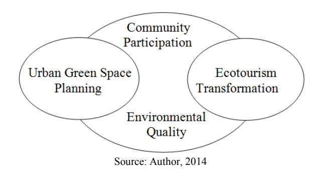
Fig. 1. Key Concepts in the Project

realized. Sustainable development depends on the relationship between eco-tourism and environment. Suitable management for eco-tourism development is essential in order to conserve and maintain the biological richness of the area as well as enhancing the economy of the local people. Eco-tourism involves the participation of the local community to enhance their livelihoods. Eco-tourism, therefore, should be regarded as an important tool for sustainable development. The promotion of eco-tourism and urban green space planning will have a positive impact on livelihoods and lead to realization of environmental benefits such as reduced pollution which helps improve public health and absorption of green house gases. This is as depicted in Fig. 2.