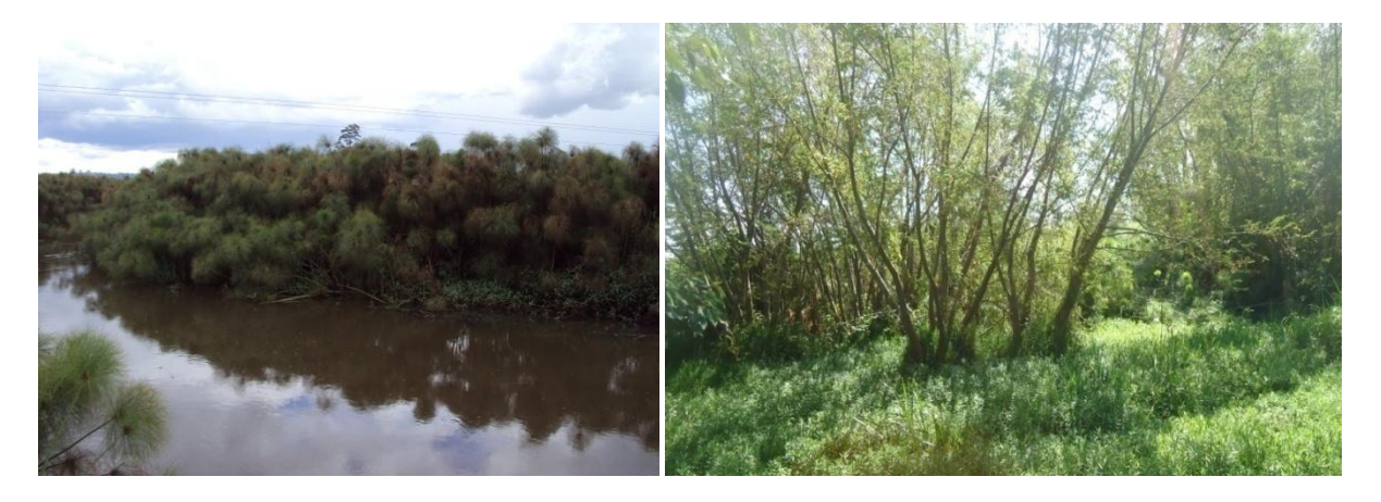
Plate 10: Goye beach- wetland -UsengePlate11:Nature trail- Mageta

During the focused group discussion respondents expressed that marine, birds, wildlife, heritage sites, were not properly utilized in Usigu division, they equated the sceneries found within their community to those found in most well-known national parks yet in Usigu division such resources were untapped.