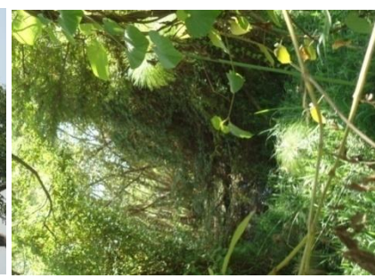
Plate 13: Usenge Hill – ((Hill Lizard) Plate 15: Bird watching