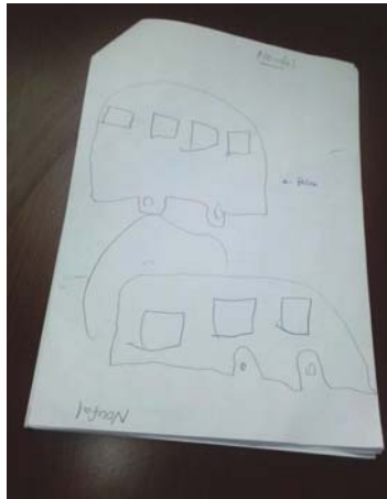
Figure 4: Pictures of police cars represent the child's (5 year-old) identity of wanting to become a police officer.

Brooks (2003) states that drawing is a unique mental tool for young children through which they form interpersonal and intrapersonal dialogue.