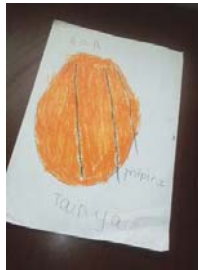
Figure 2: A picture of an airplane drawn by a 6 year old to represent a pilot.

Figure 1: A 4 year old has drawn a ball to show her admiration of a footballer. She writes English (ball) and Kiswahili (mipira).