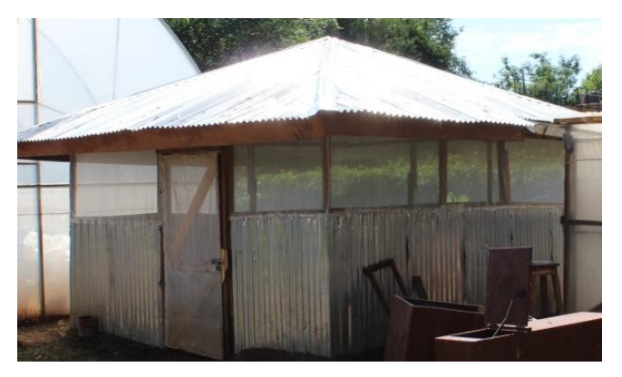
Fig 2: Prefabricated house