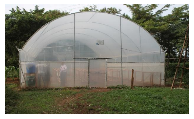
Fig 1: Tunnel house

Two housing types were used in the experiment: a tunnel house, measuring 8m \times 15m (Fig.1) and a prefabricated house measuring, 7m \times 7m \times 5m completed with netting material and iron sheets on the sides as well as the roof (Fig. 2). The crickets were reared under the prevailing climatic conditions within the housing systems, that is, there was no control of temperature and relative humidity.