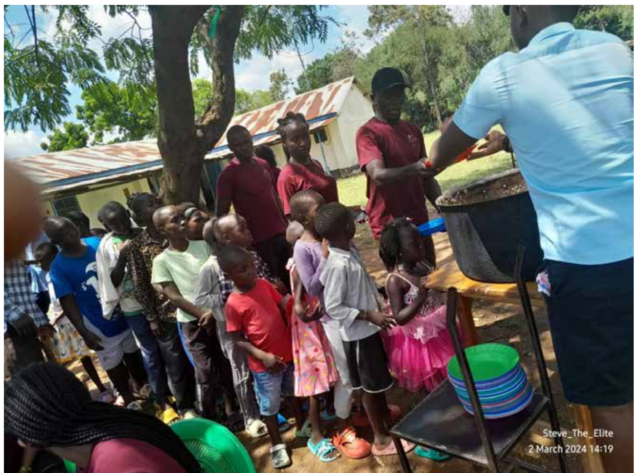
Charity Club members serve lunch to the children