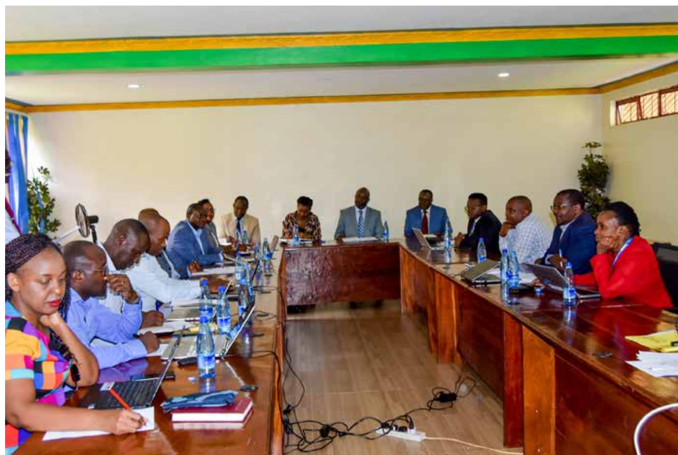
Attendees listen to a presentation on JOOUST Commercialization Masterplan

Previously, JOOUST has proudly participated in the Accelerated Research to Commercialization program, a collaborative initiative of Victoria Ventures