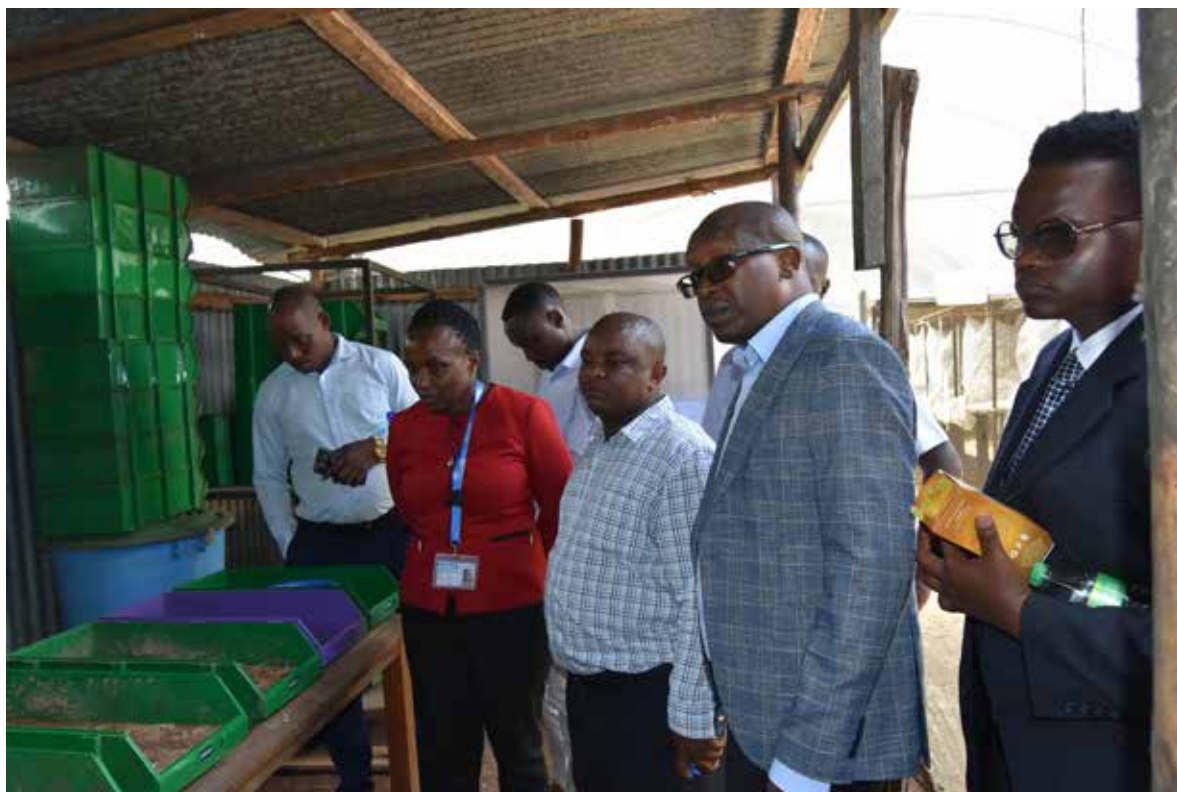
Visitors tour the various JOOUST projects

After the presentations, the guests had an opportunity of carrying out an excursion to the various inventions within the Campus with the aim of developing their own commercialization master plans.