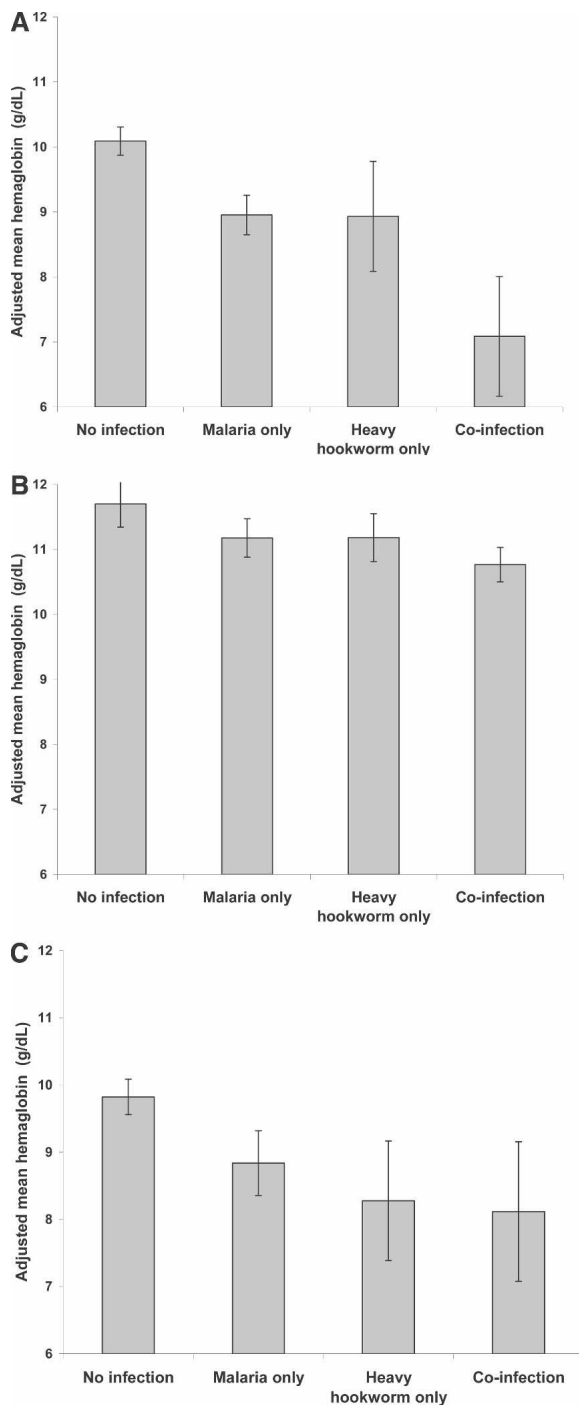
FIGURE 3. The relationship between plasmodia-hookworm co-infection and mean hemoglobin concentration in Kenya based on re-analysis of published data. A ) Preschool children: 460 children: 61.5% were uninfected; 30.9% infected with P. falciparum alone; 4.1% with heavy hookworm (eggs/gram feces [epg] > 2,000; 3.5% with both, based on Brooker and others 116 B , School-age children: 392 children: 19.1% were uninfected; 27.8% infected with P. falciparum alone; 17.9% with heavy hookworm (epg > 2,000); and 35.2% with both, based on Stephenson and others. 48 C , Pregnant women: 251 women: 68.5% were uninfected; 21.1% infected with P. falciparum alone; 6.0% with heavy hookworm (epg > 2,000); and 4.4% with both, based on Shulman and others. 117 Mean hemoglobin based on regression modeling adjusting for age, sex, nutrition status, socioeconomic status (preschool children), and gestation (pregnant women). Error bars indicate 95% confidence intervals.

eas of high helminth prevalence, to provide anthelmintic treatment to children from the age of 12 months. 65,66 Thus, anthelmintic treatment could potentially be co-administered with IPT to children 1–5 years of age in areas of seasonal malaria transmission. Based on current guidelines, deworming is unable to be provided as part of IPTi activities.