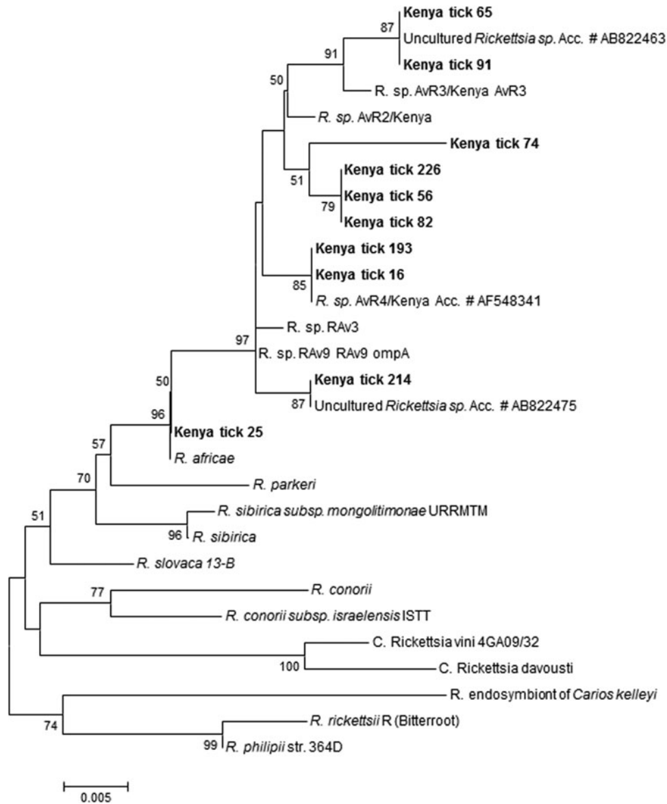
FIG. 2. ompA partial gene sequences of rickettsiae detected in ticks obtained from domestic animals in western Kenya. The tree was inferred using the neighbor-joining method Bootstrap (1000 replicates) involving rickettsiae detected in this study and strains from GenBank.

sequences were identical to Rickettsia sp. AvR/4 Kenya (GenBank accession no. AF548341) that was detected in A. variegatum from Maasai Mara, Kenya (Macaluso et al. 2003). Uncultured Rickettsia spp. (GenBank accession nos. AB822463 and AB822475) (Nakao et al. 2013) were detected in three of 10 samples analyzed. However, ompA sequences of four of 10 tick DNA preparations were unique in that they had a 173-bp nucleotide insertion and a 5-nucleotide deletion in one of the sequences. In addition to nucleotide substitution, we report for the first time existence of a deletion mutation in the ompA and ompB genes of some R. africae variants. The percent divergence of the ompA and ompB sequences in the R. africae variants to the next closest accepted Rickettsia species, R. africae , was less than that required to define a new species (Fournier et al. 2003). Thus, we refer to these molecular isolates as R. africae variants as previously reported (Parola et al. 2001).