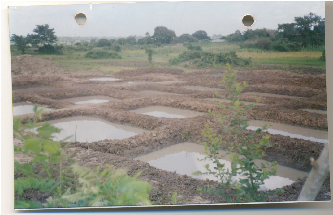
Figure 1 Lay-out of earthen ponds at the study site located at Kaaka Fish Farm, Namutumba district