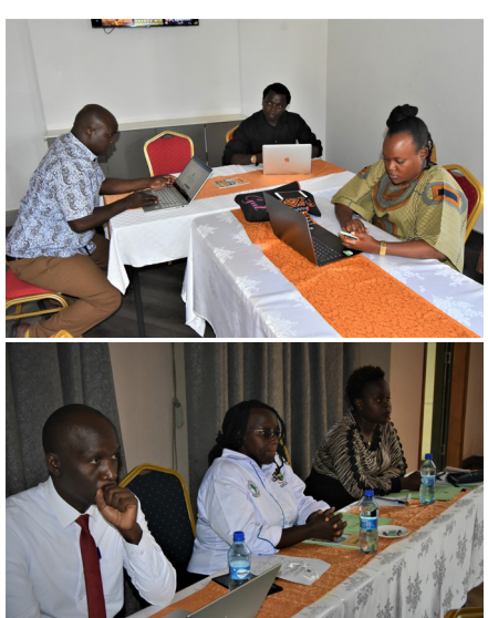
SIIS held a three-day workshop between 28th- 30th June 2023 in Kisumu at the Comfort Inn Hotel aimed at digitizing the University through the establishment of new programmes that will position JOOUST students competitively in the digital job market.