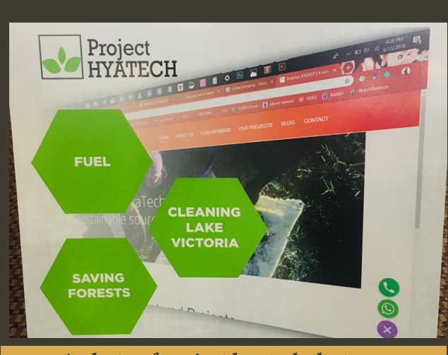
A photo of project hyatech that won ENACTUS Kenya national expo in 2019.

These unrelenting game changers birthed 'Mind you, your Mind matters' in 2020, which involved