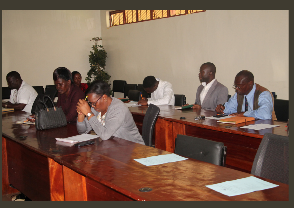
The staff members listening in during the meeting held at the East Africa Community Integrated Institute.