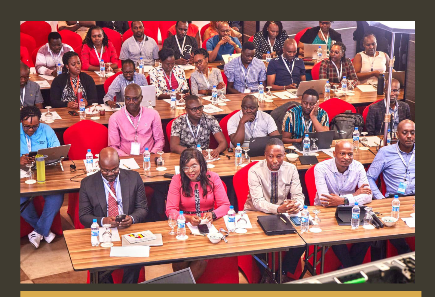
Delegates representing different organizations at the Governance, Risk and Compliance conference.