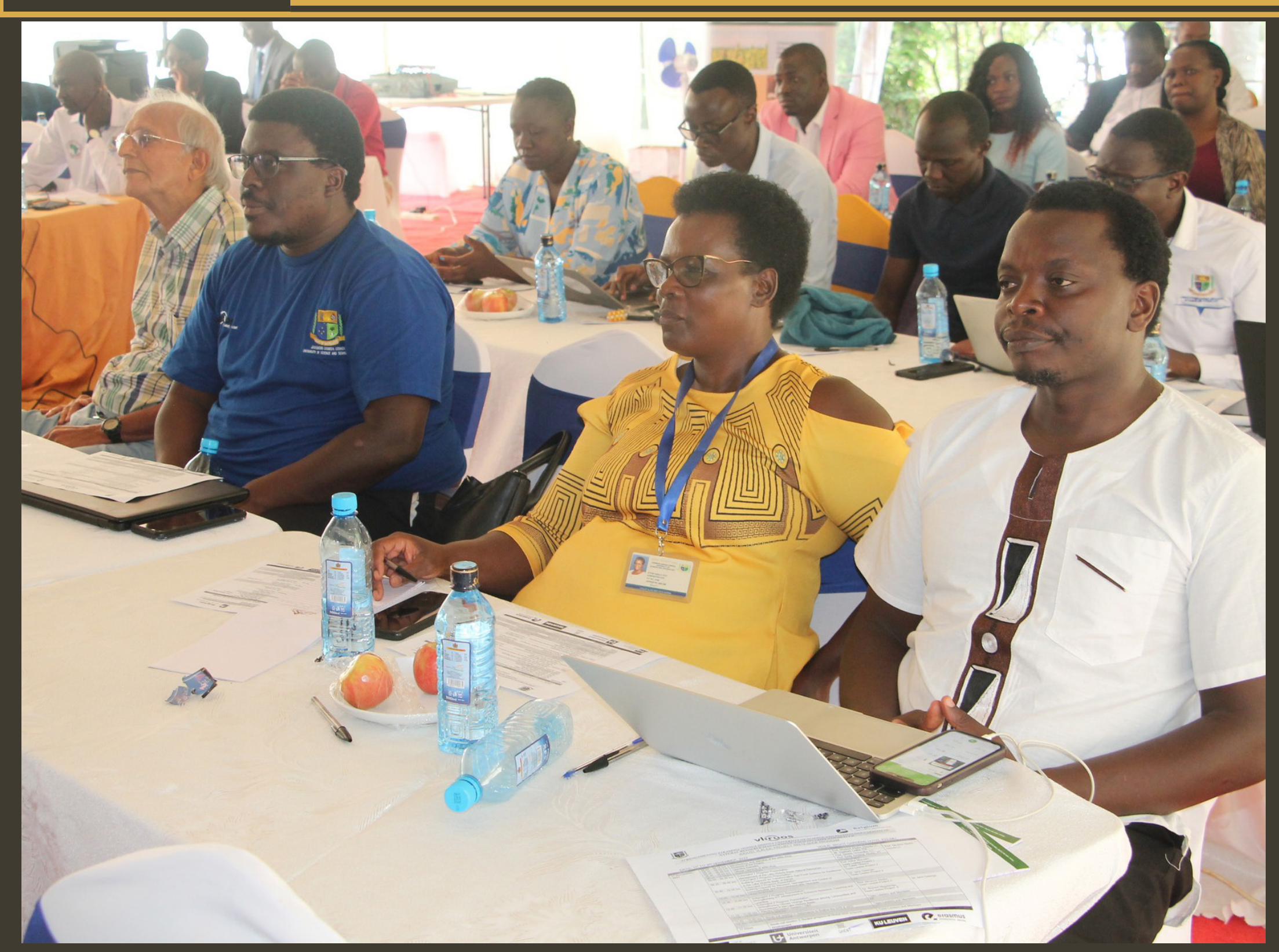
JOOUST VLIR-IUC Project members during the Write-off workshop in Kisumu Hotel.

A Publication from the Office of the Vice-Chancellor