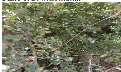
Plate 6: B. wilsoniana .