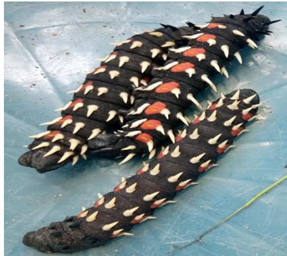
Plate 2: B. alcinoe