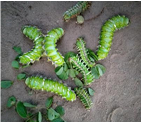
Plate 3: G. maja