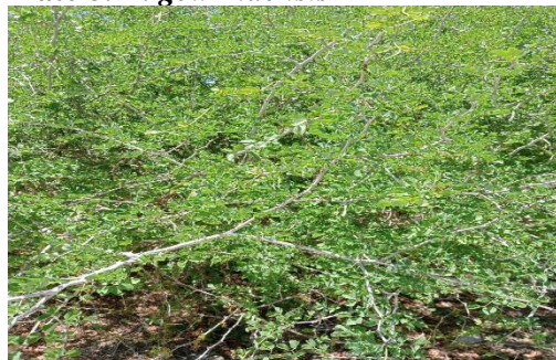
Plate 8: A. gourmaensis