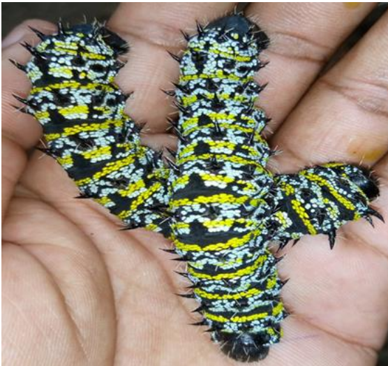
Plate 1: G. zambezina