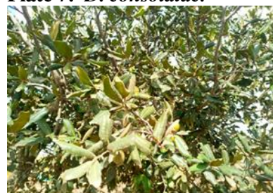
Plate 7: D. consolatae .