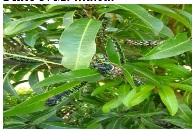
Plate 5: M. indica .