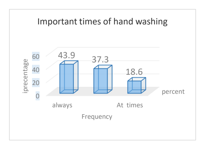
Figure 4.2: Frequency of hand washing.

The most effective practice in cholera prevention was hand washing with soap and safe water according to 56.8% (n=137) while hand washing and latrine use was rated effective by 30.7% (n=74) of the respondents. Hand washing after using toilet and before eating 68.9% (n=166) and before, during and after preparing food and between handling raw and cooked food 25.3% (n=61), appeared to be the most critical times of hand washing according to the respondents. Majority of the respondents either wash their hands occasionally 37.3 % (n=90) or at times 18.7% (n=45) at critical times of hand washing compared to 44% (n=106) who always wash their hands.