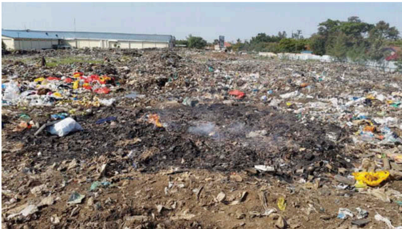
Figure 1. Status of Kachok dumpsite (KISWAMP 2009).

Based on reviewed documents and other reports (Carl 2001), utilization of waste as a resource is not efficiently and properly performed in Kisumu City. In particular, energy recovery from MSW